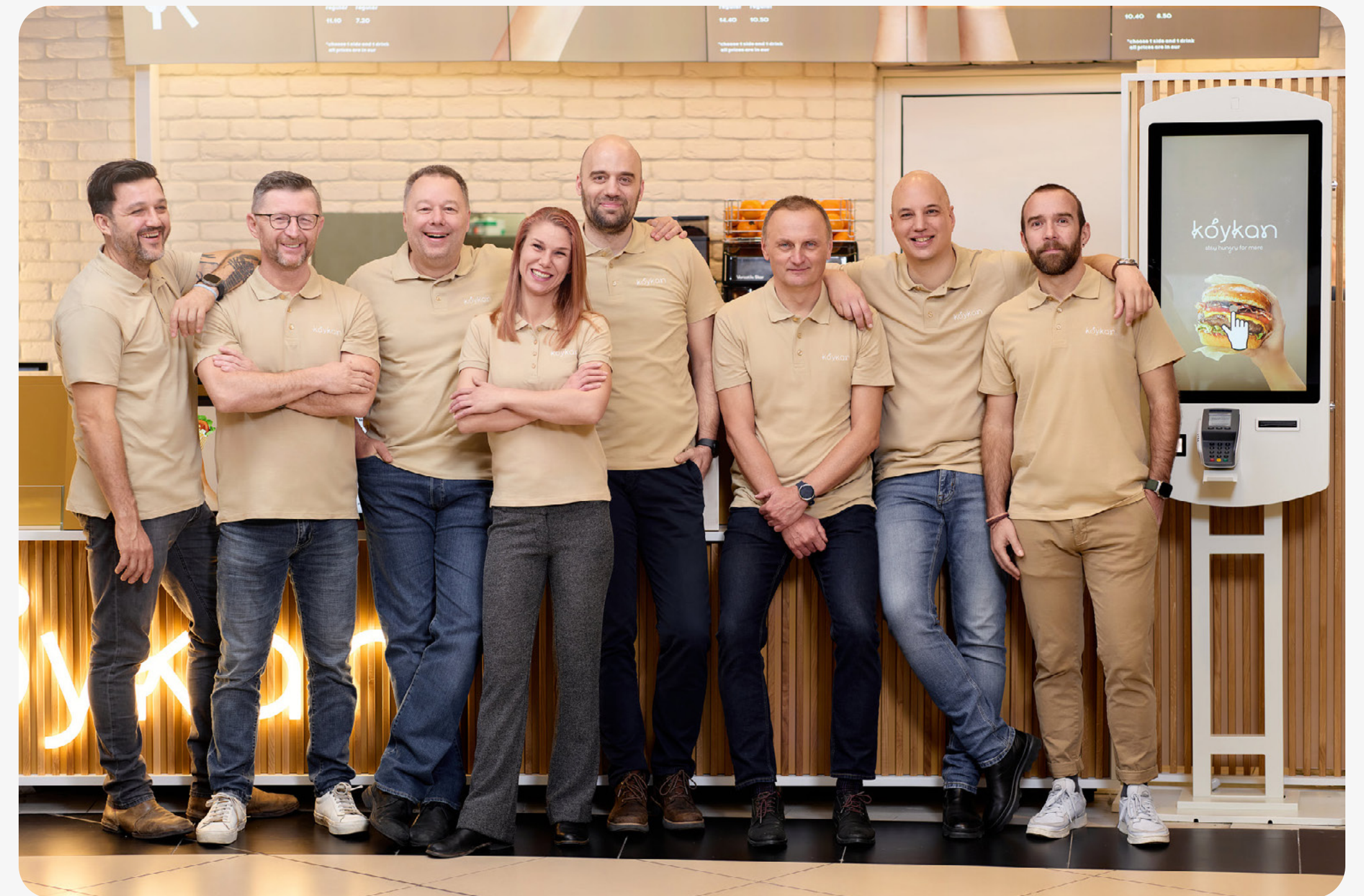
Koykan Management Team