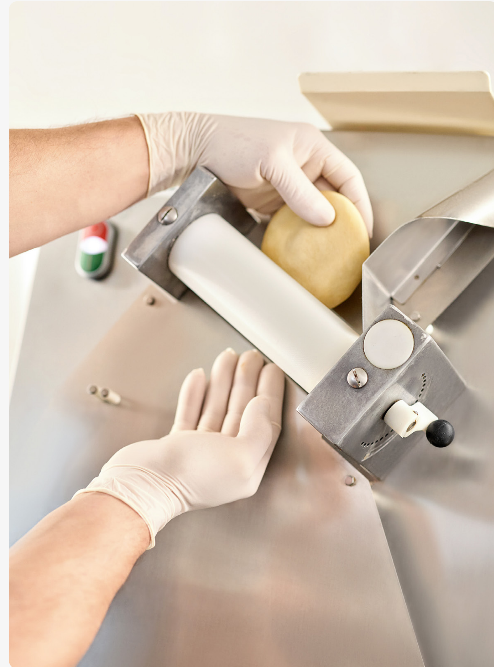
Our piadina bread is handmade by expert artisans in our culinary centers.